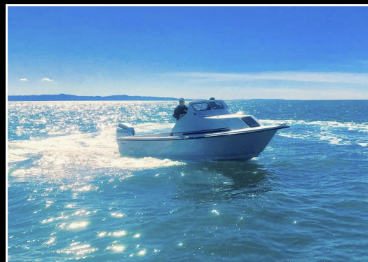
20' with STANDARD CABIN